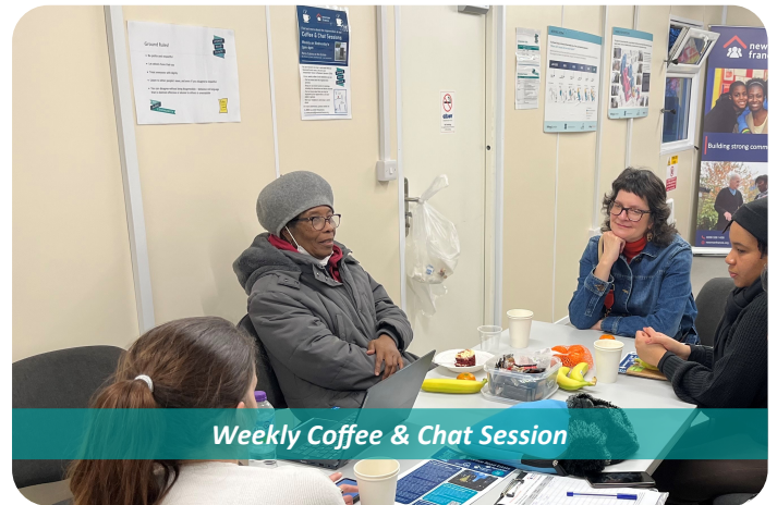
Weekly Coffee & Chat Session

Once a decision has been reached from the GLA, the council will write to residents to update you on the full planning status of the scheme and the next steps.