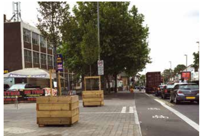
Example of a Copenhagen crossing