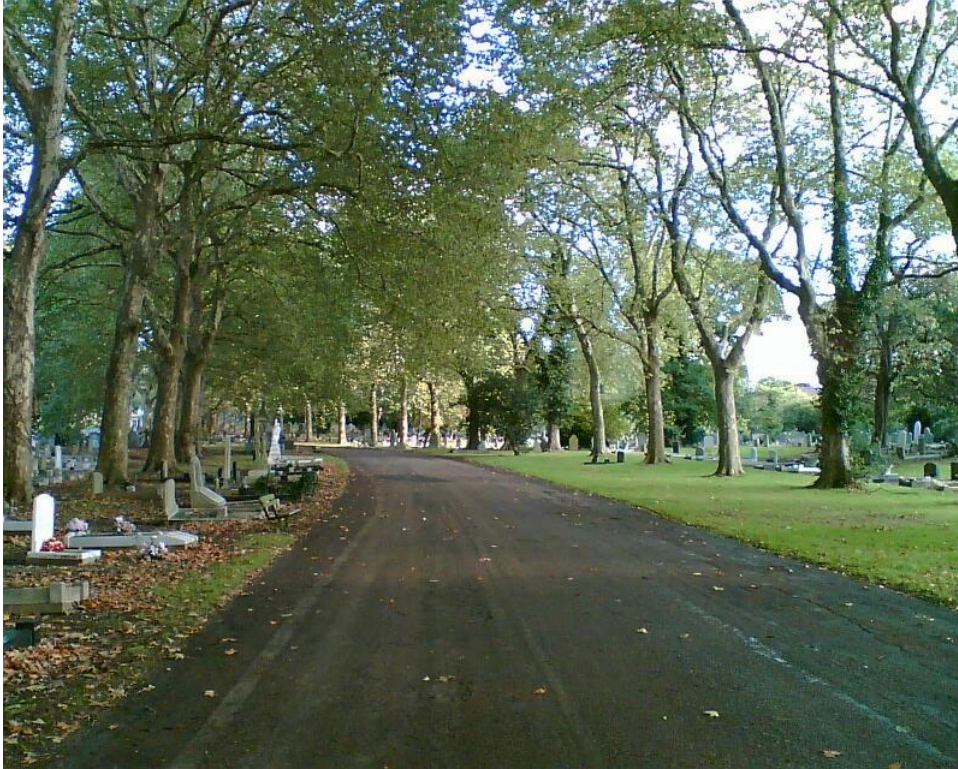
Chingford Mount Cemetery, 121 Old Church Road, Chingford, London E4 6ST