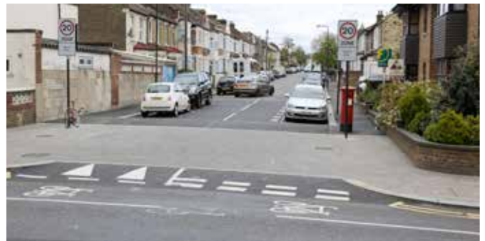
Example of Blended 'Copenhagen' crossing, which prioritises pedestrians at junctions: