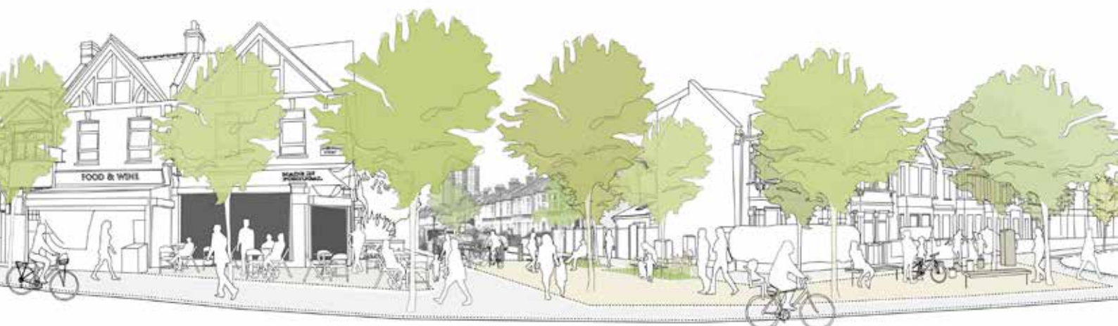
Greville Road and Shernhall Street