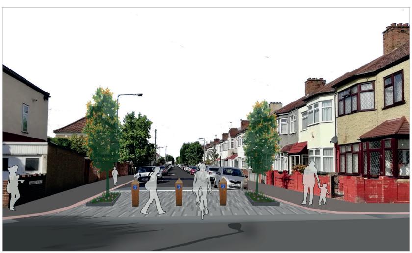
Illustration of a proposed modal filter at Farmilo Road