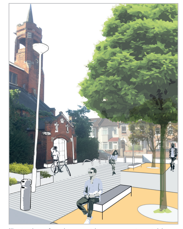
Illustration of environment improvements outside St Barnabas Church